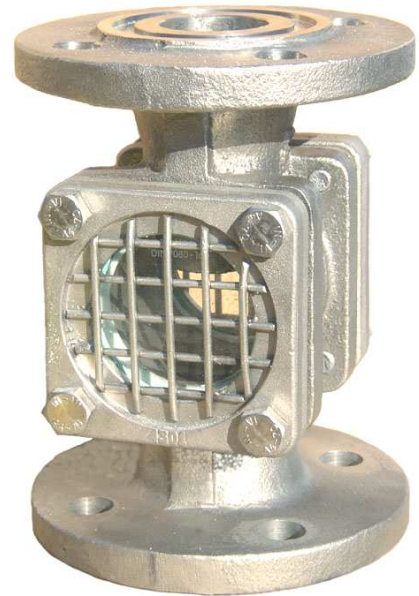
Protective fence on a sight flow indicator NORIS Bauform 880