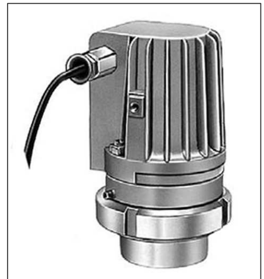
EX-light fitting KEL mounted on screwed sight glass similar to DIN 11851